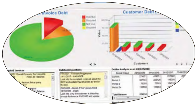
Credit Management Company View